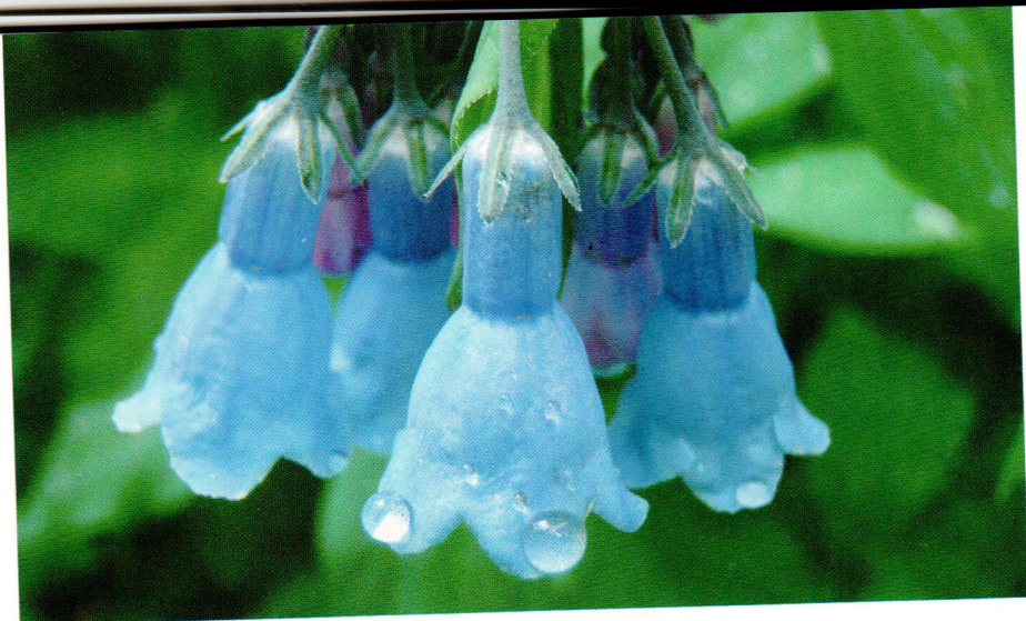
Tall chiming bells (Mertensia ciliata) are often seen while hiking wilderness trails.

Enter the wilderness at the 2-mile point. The trail eases as you hike along an open slope laden with summer wildflowers. The area provides views of Hermosa Cliffs to the southwest and Engineer Mountain to the west. Descend moderately to Three Lakes Creek at 2.7 miles, one of many fords on this route. The trail stays mostly level as you cross creek after creek, alternating between trees, meadows, and open slopes. You will reach scenic Crater Lake at 5.2 miles.